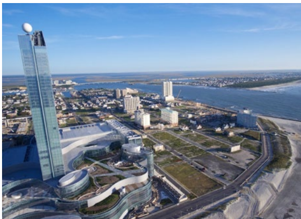
Figure 1: Ocean Casino Resort

In another example, Ocean Casino Resort, formerly known as Revel Casino Hotel, is considered the largest and most expensive failure in the region, costing $2.4 billion in losses (CBS Evening News, 2014). This business was originally designed for families, promising a lavish waterslide and many family-oriented amenities as well as a second tower on the north side. Figure 1 (Google, 2021) is an aerial view of the property with only one tower, no waterslide, and an incomplete second tower built only up to the main building’s rooftop garden. Figure 2 is a 3D sketch rendering of the full property design. This photo was taken from Bright Sun Films (Bright Sun Films, 2020). This project has demonstrated unsecured funding can negatively impact the future of a business, the customers it attracts, and how revenue gets allocated back into the city.